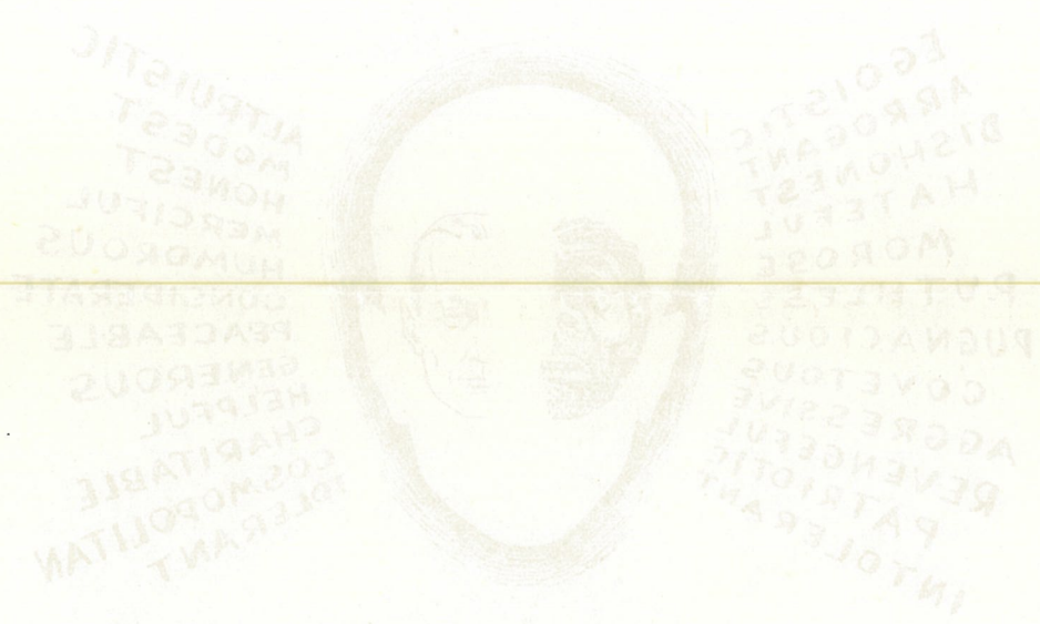
The two minds of present man.

Today we only know of one consciousness, but the next generation will know that the so-called modern human being has two. One is governed by the moral which teaches the strongest has right to rule. It believes in the right to hate, to take revenge and to destroy. This is the oldest moral. Behind that moral a new consciousness has slowly developed, and its moral is: "To love those who hate us, to forgive those who do us wrong, to love our neighbors as we love ourselves, to show tolerance to those who treat us with intolerance, yes, to even forgive those who want to take our lives". This highly cosmic moral was Christ's, and it is his moral we shall try to copy for that is the key to the door which opens up to the golden land of Eternity. If we learn to know those two morals and the true reason for their existence in us, we will have another important key in our hands, namely: "The