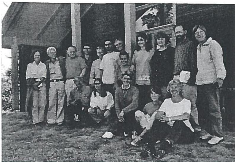
The English study group 2001