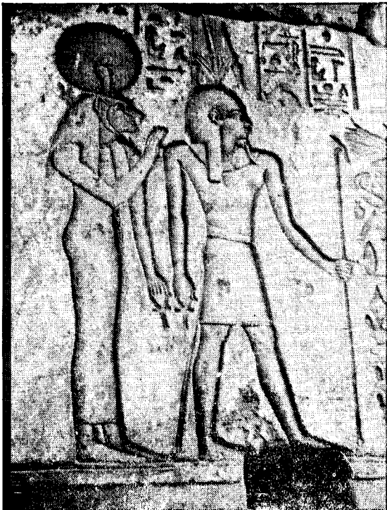
Egyptian Gods with animal heads

the real knowledge behind the mysteries was lost so that those who were to lead and guide the people gradually became as naive about religious matters as the people themselves. People took the parables and symbols literally and religion became mere ceremonies and dogmas. While a king or high priest of the past who was really initiated into the mysteries knew what lay hidden in the expression "virgin birth" and that behind this expression there was no reference whatsoever to physical birth, neither the priests of a later time who had not undergone such an initiation nor the religious authorities of our time knew anything of these mysteries and therefore believed and still believe that it is a matter of a real physical event which, because it is not common, must be described as a miracle.