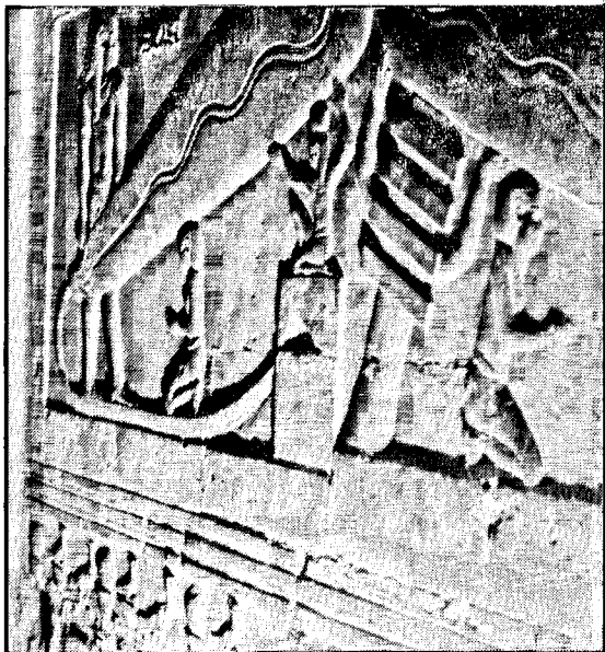
An ancient Egyptian "battery"